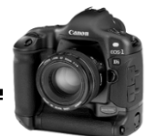
Photo Packages less than four hours are subject to availability. Call for details. Mountain Memories reserves the right to use any photo for promotional purposes.